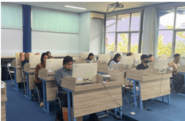
The translation and editing test

With the TSN, HPI is playing a crucial role in shaping the future of the translation and interpreting industry in Indonesia. By promoting excellence and professionalism, HPI is helping to build a more credible and trustworthy industry that meets the needs of clients and professionals alike.