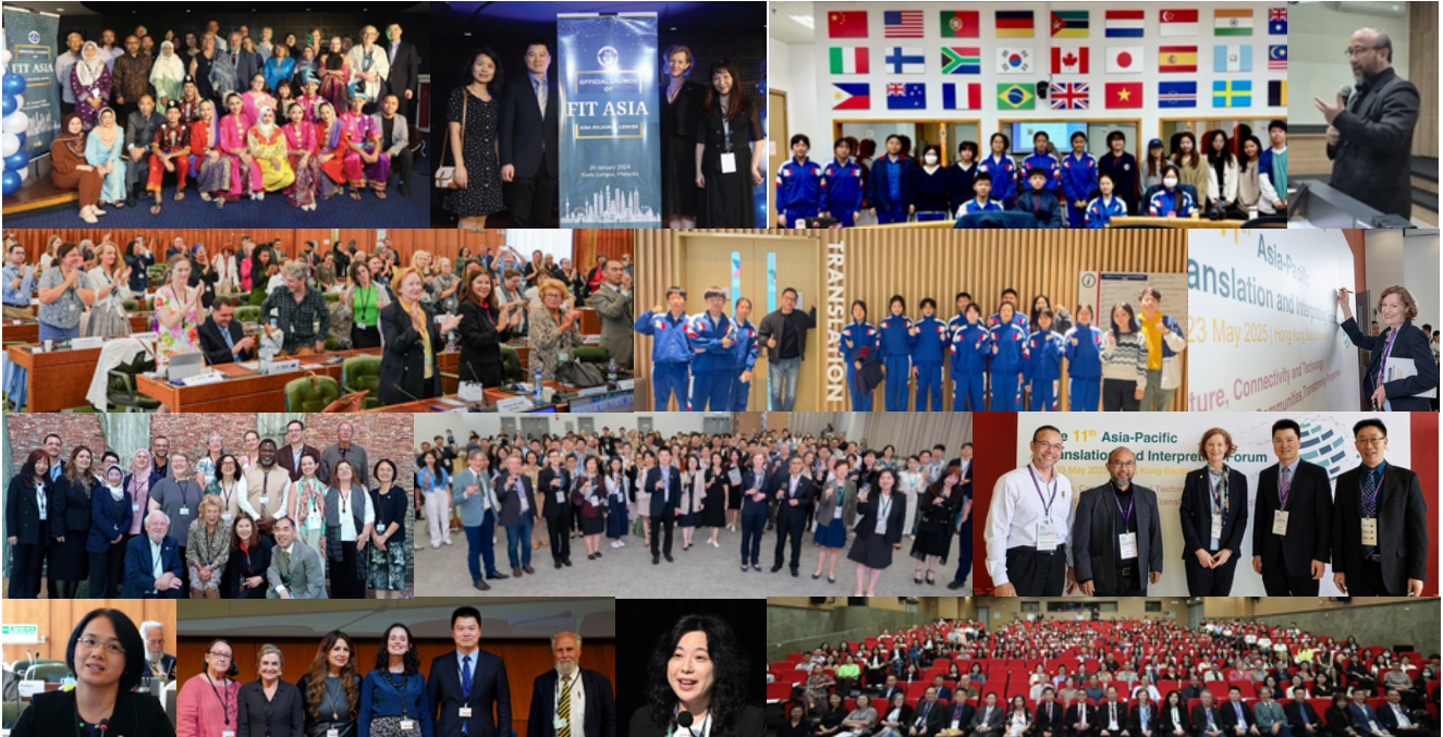
Translators and interpreters from around the world