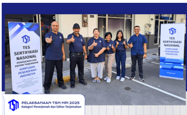
Translators and editors

In a bid to enhance the quality and credibility of translation and interpretation services in Indonesia, Himpunan Penerjemah Indonesia (HPI) or the Association of Indonesian Translators conducted an annual National Certification Test (TSN) on July 19 and 26, 2025 for its members. The TSN is designed to assess the skills and knowledge of translators, translation editors, and interpreters, ensuring they meet the highest industry standards.