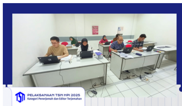
Translators and editors

The TSN serves as a benchmark for the industry, providing a platform for language professionals to demonstrate their expertise and commitment to their craft. By setting a high standard for certification, HPI aims to increase client trust and confidence in the services provided by certified translators, translation editors, and interpreters.