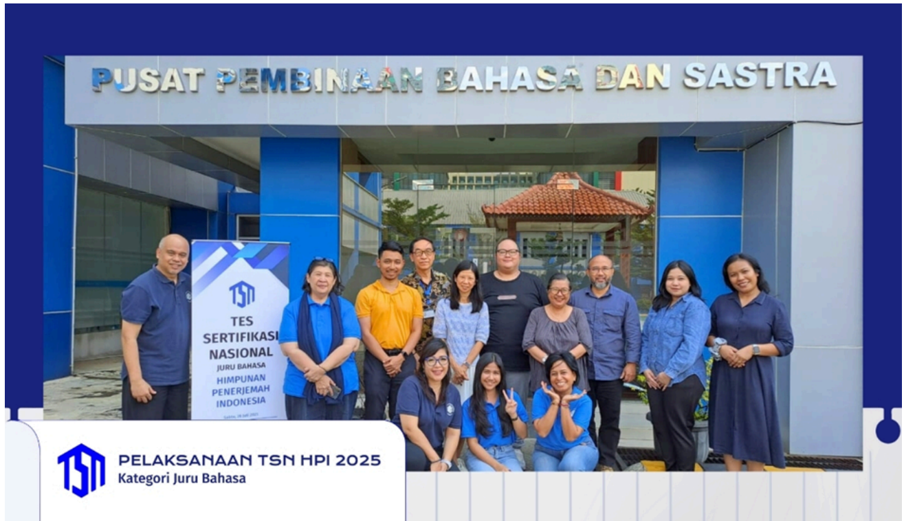
The interpreters

The implementation of the TSN is expected to have a positive impact on the industry, driving up standards and promoting excellence in translation and interpreting services. As the industry continues to grow and evolve, the need for certified professionals will become increasingly important.