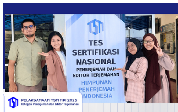
Translators and editors

Held in Jakarta and Malang – Indonesia, the TSN offers a range of categories and language pairs, including legal and general translation, as well as conference interpreting. A total of 89 participants took part in the event, consisting of 78 in translation, 5 in translation editing, and 6 in conference interpreting. Covering language pairs such as English <> Indonesian, Mandarin <> Indonesian, Japanese > Indonesian, Arabic > Indonesian, and German > Indonesian, the TSN highlights not only the diversity of languages but also the growing demand for highly skilled practitioners across multiple domains.